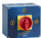
R05M Manual changeover switch

The manual changeover switch is used to connect and disconnect a generating set manually to a domestic circuit when there is a power cut.